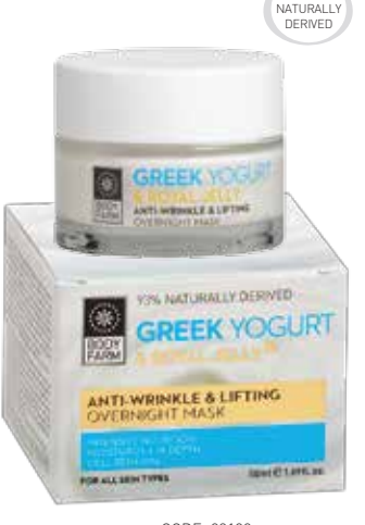
CODE: 02108 50ml

Intensive care day cream for immediate and visible results. Its novel composition offers rich nutrition and deep hydration, while helping in the reduction of wrinkles and free radicals offering firm, smooth and youthful skin.